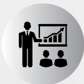
Workshops / Seminars / Guest Lectures